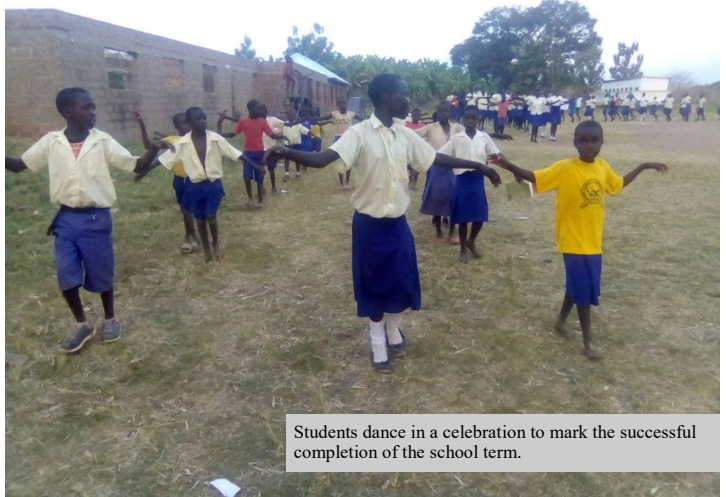
Students dance in a celebration to mark the successful completion of the school term.

Success Stories: In 2019, students at Mama Hellen's School scored the highest of any others at their level in standardized tests, making Mama Hellen's School the top school in South Sudan. In 2020, schools in South Sudan closed because of COVID-19. The local government used radio to provide education for children while the schools were closed. This was very challenging because most families did not have access to radios and many remote areas had no reception. With Mama