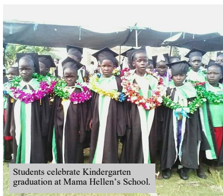
Students celebrate Kindergarten graduation at Mama Hellen's School.