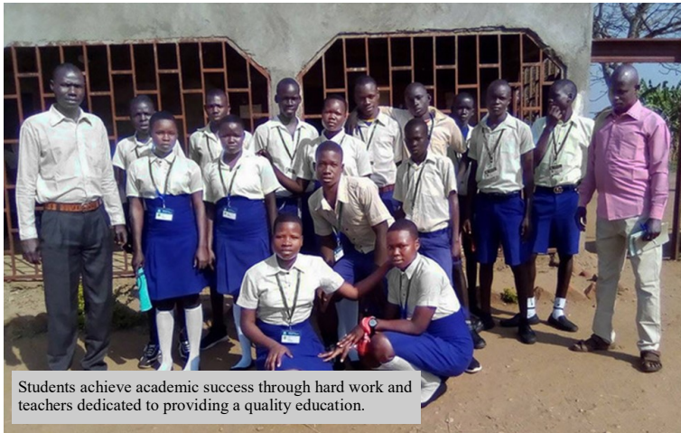
Students achieve academic success through hard work and teachers dedicated to providing a quality education.